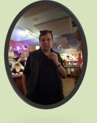
Official... (off to the side) chair ...thoughts...