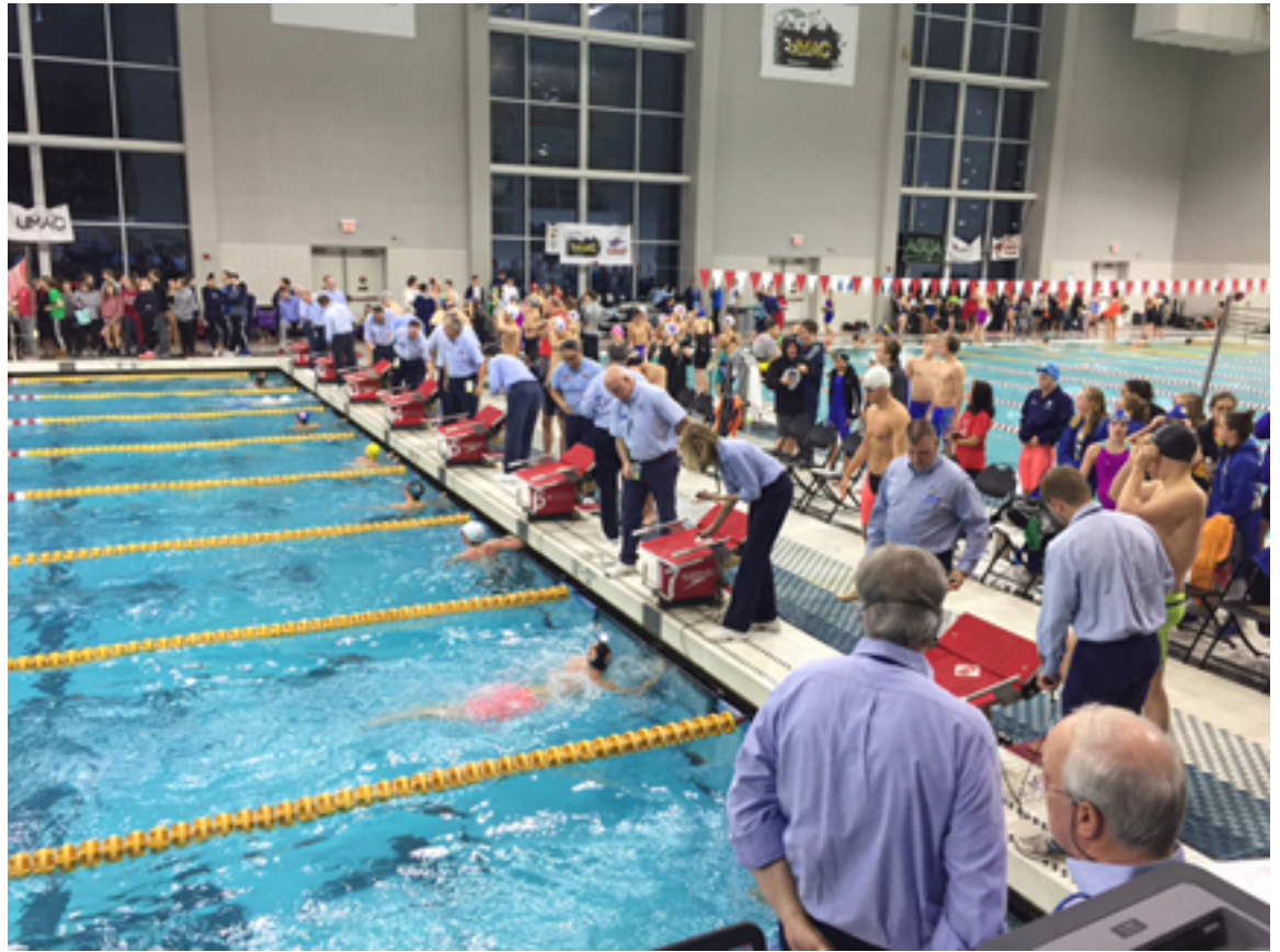
When can I engage with a National Evaluator?

National Evaluators represent USA Swimming and are accountable for ensuring high quality officiating consistent with National Standards. The Evaluators mentor, educate and motivate with an eye on improving and retaining officials. During an evaluation, these individuals provide meaningful and encouraging feedback to an official looking to recertify or advance and are accountable for ensuring officials are ready to work on the Sectional/Zone (N2) or National Championship deck (N3). This includes the responsibility for being certain that the evaluated official knows the rules, the position protocols/procedures, effectively communicates and collaborates with team members and most importantly, is ready for advancement to the next level. National Evaluators are also accountable for the continuation of their own education and certifications through participation in forums, discussions, conventions, meetings, clinics as well as assignment at National or other high level meets.